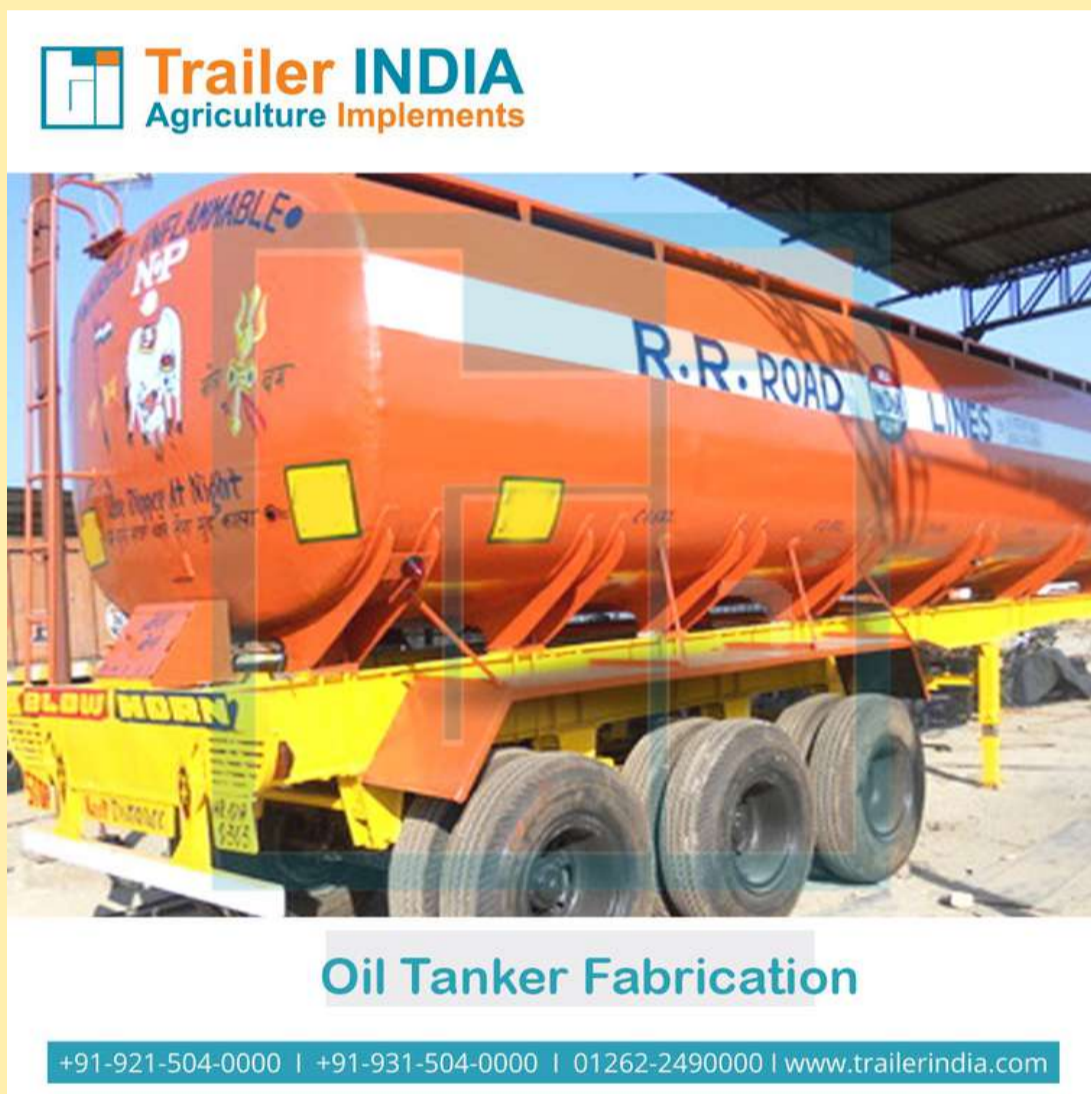
Oil Tanker Fabrication

We are involved in manufacturing and supplying a wide variety of Oil Tanker Fabrication 35 KL TATA 4018 that is fabricated along with the perforated sheet of the chequered sheet. These trailers are highly appreciated for their longer functional life and our products are available in various dimensions and designs in the market. These are available to transport the oils and we offer them at market leading prices to our valuable clients.