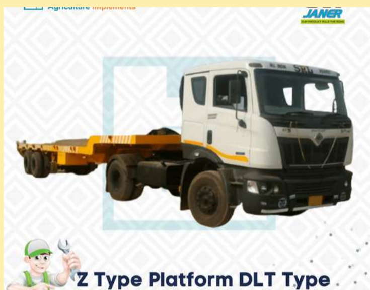
Z Type Platform DLT Type