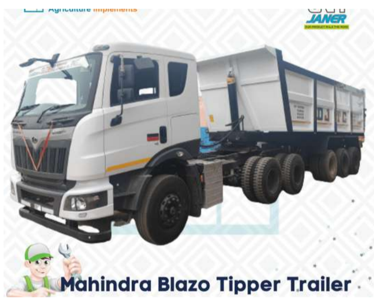
Mahindra Blazo Tipper Trailer